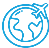
Tourist states and regions