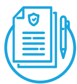
Cities, communes, countries, voivodeships