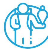
Meetings with travelers