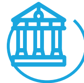
Monuments in Poland and abroad